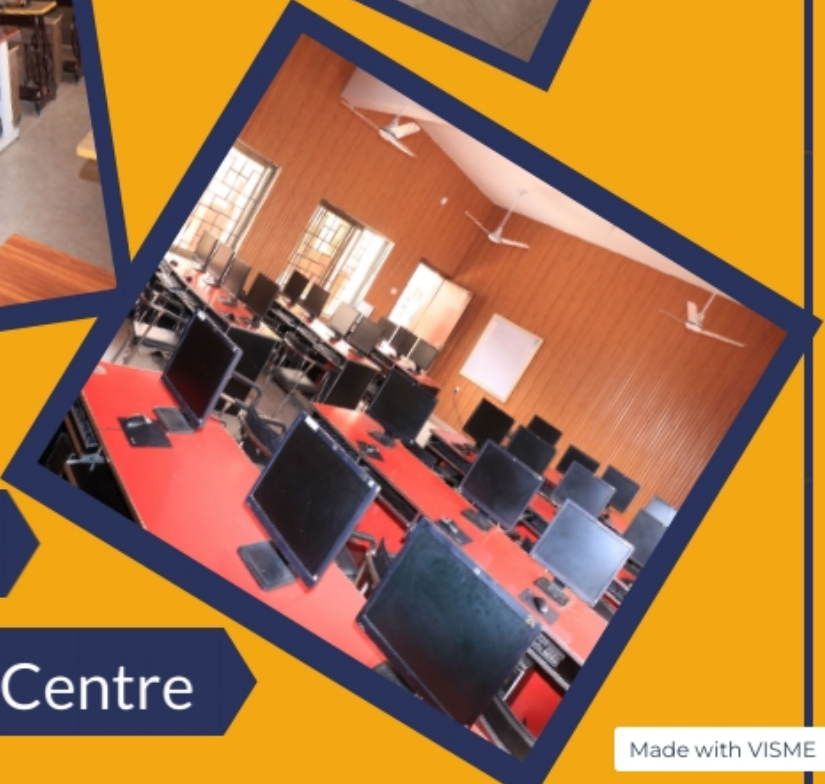
Vocational Training Centre